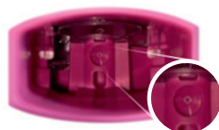
Clean nozzle ✓